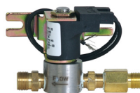
GF-990-53 Solenoid Valve