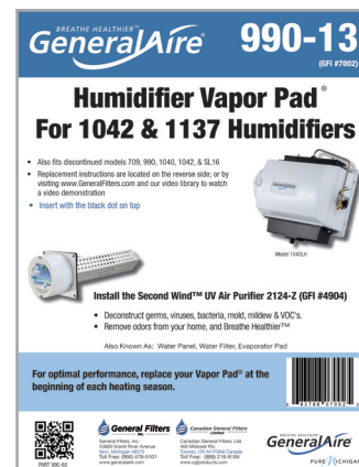
GF-990-13 Vapor Pad®