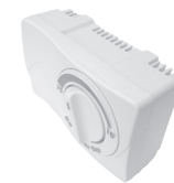
GF-MHX3 Manual Humidistat Included in GF-1042DMM