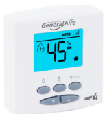
GFX4 Automatic Humidistat Controls the Furnace Blower Motor